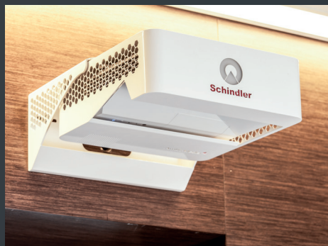
Sleek – and vandal-proof – design

Special short-distance projectors installed above the doors are bright enough to work in daylight. As the projectors are linked with the door control, passengers are not dazzled.