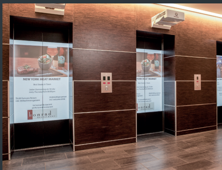
Special foil for a sharp image

A special foil delivers bright and sharp images or animations. Depending on the surrounding illumination, the most suitable foil can be chosen.